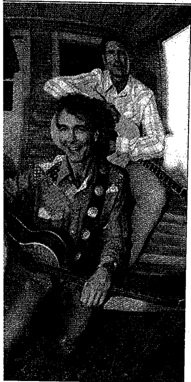
The Old Plank All-Stars perform at America's Club at Walter Payton's Roundhouse.

Superman! Drury Lane, Oakbrook Res. plenty of s and comic launch pack- 1111.